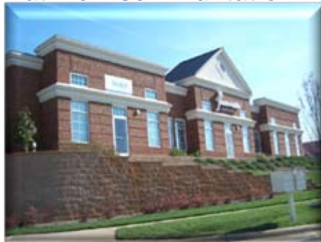
Iredell Health System at Morrison Plantation