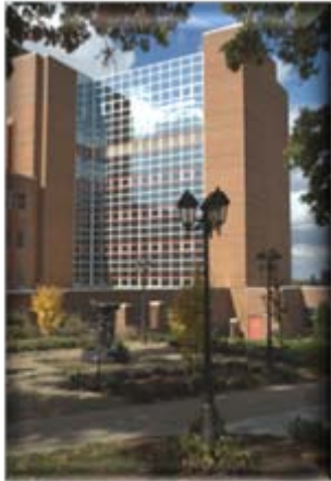
Iredell Memorial Hospital